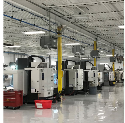
Hammond's Colby Drive facility is dedicated to modifications.