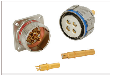
Quadrax Multi-Signal Contact Systems