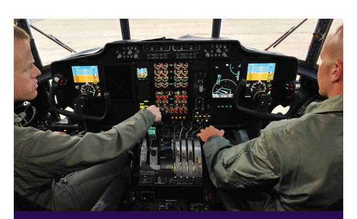
WEIGHT REDUCTION HIGH DENSITY / SIZE REDUCTION INCREASED EASE OF ASSEMBLY & MAINTENANCE HIGH-SPEED DATA TRANSMISSION

38999-Style Series I, II, III Connectors designed to withstand extreme shock, exposure, and vibration. Customizable with high-speed or fiber termini, hermetics, filters & custom mounting.